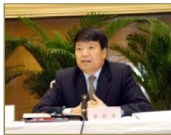
Shaoshi Xu Minister of Land and Resources, People's Republic of China