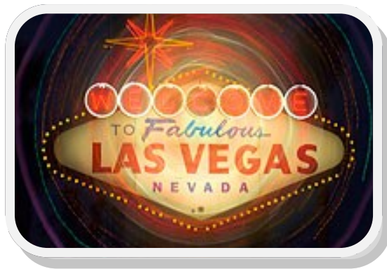
MINEXPO 2008 REGISTRATION IN NORTH HALL